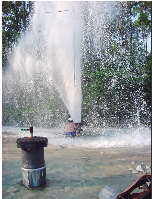
Groundwater well (courtesy Florida Geological Survey archives).